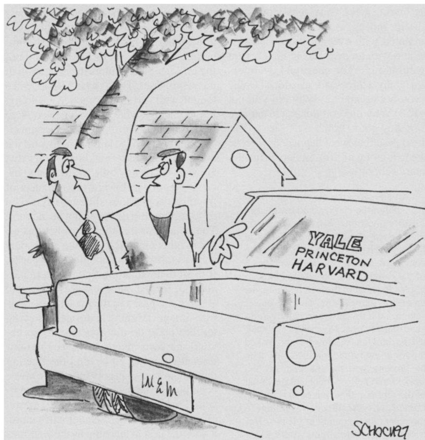
"No, it wasn't expensive. The decals only cost a dollar apiece."

Alston's reading shows a humility before the narrowness of our contemporary experience and an openness before the expanse of the history of the species. It grants people in the past the benefit of the doubt by casting doubt on our ability to know them as easily as we know ourselves. This does not mean that we cannot judge the past — we can't help making judgments. But it does mean that we must not rush to